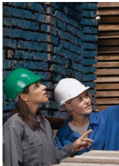
Stakeholders and the forest products sector rely on QMI for certification to a variety of standards.